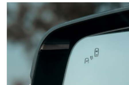
Blind Spot Detection