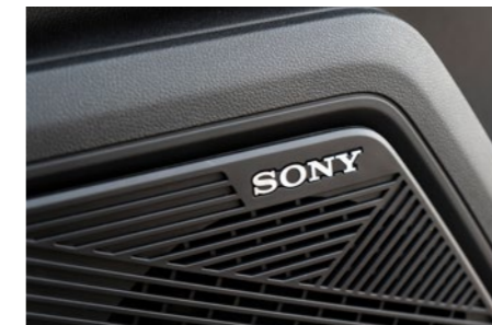
Sony Premium Sound System