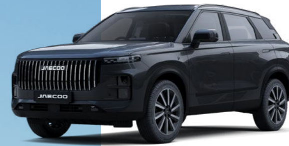
Carbon Crystal Black