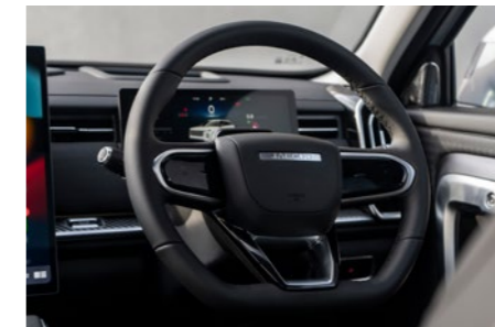
Steering Wheel with Multi-functional Controls