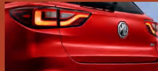
Rugged rear design

The London Eye Headlamp reflected in the Thames River, interplay with the radiant grille, shimmering and extraordinary. Classic British design elements create the understated, dynamic and highly recognizable ZS.