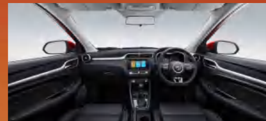
Convenient and cosy home

The athletic side profile conveys a poised and dynamic posture, ready to meet your travel needs anytime and anywhere.