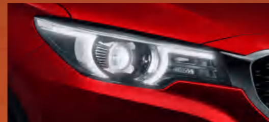
London Eye Shines in the Starry Sky

Inspired by British design, classic and timeless, the cabin offers a comfortable and practical experience that feels like home.