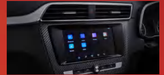
Three Steering Modes

The engine's maximum power output is 84kW, with a peak torque of 150N m, providing ample power. With a dependable transmission, the combination ensures reliability and durability.