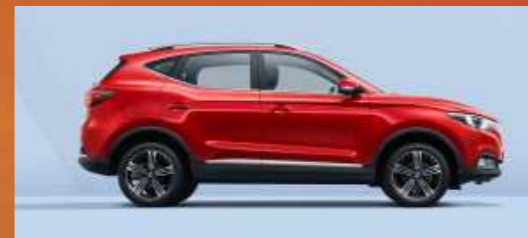
Dynamic side styling

The rear stance is solid and stable, with the taillights and tailgate switch design showcasing its personality.