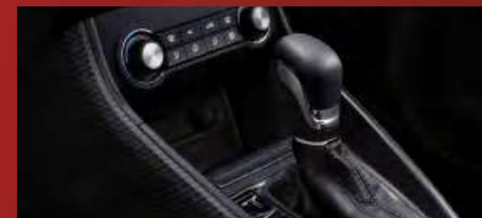
20+ storage spaces

Rear legroom extends up to 850mm, allowing for comfortable leg extension without feeling cramped.