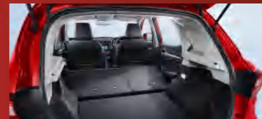
Large-sized flat boot

Comfortable ergonomic high seats with a wider field of vision for a more reassuring drive.