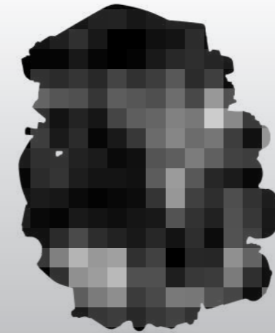
NSE Major 1.5L + Aisin 4-AT Transmission

The engine's maximum power output is 84kW, with a peak torque of 150N m, providing ample power. With a dependable transmission, the combination ensures reliability and durability.