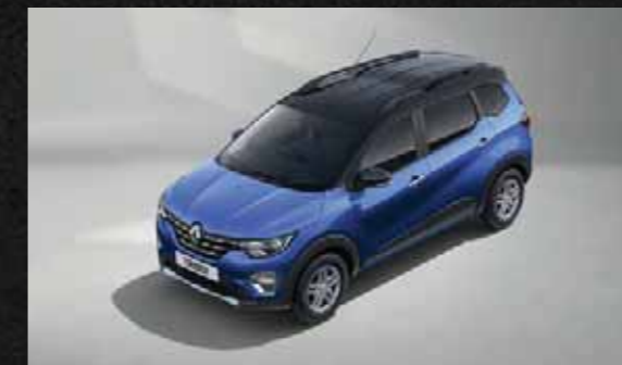
ELECTRIC BLUE (MP)