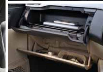
Upper and lower glovebox