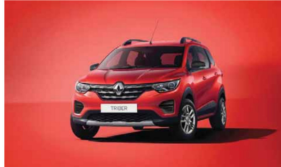
FIERY RED (MP)