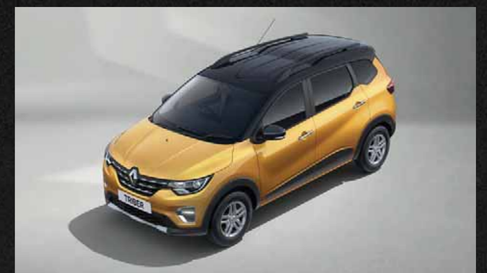
HONEY YELLOW (MP)

Features and images may vary and be optional depending on model, and are subject to change without notice.