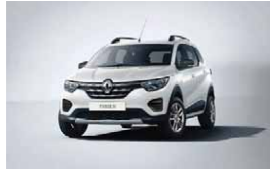
ICE COOL WHITE (NM)