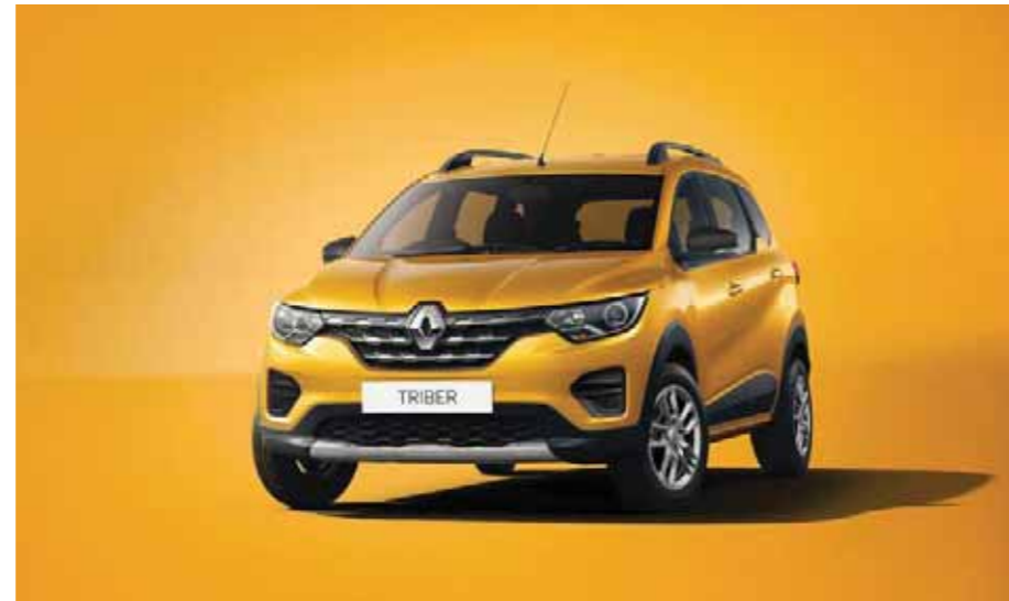
HONEY YELLOW (MP)

NM: Clearcoat Opaque; MP: Metallic Paint