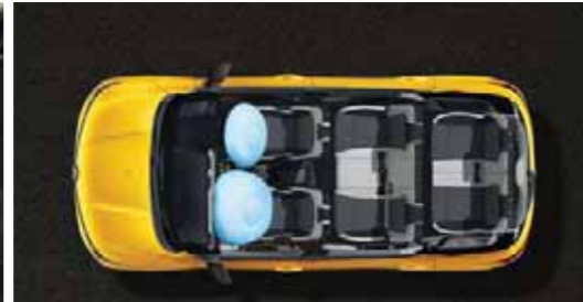
Dual Airbags - Driver and front passenger