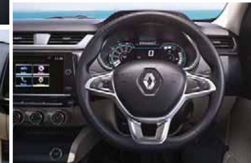
Steering wheel mounted controls