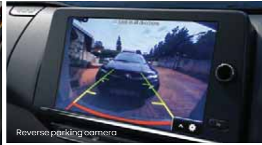
Reverse parking camera