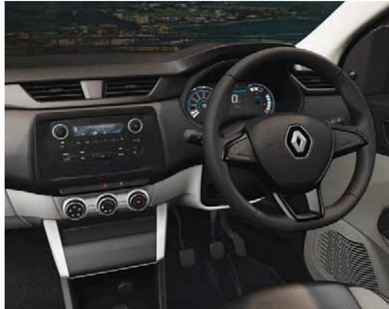
Life interior with R&Go® radio