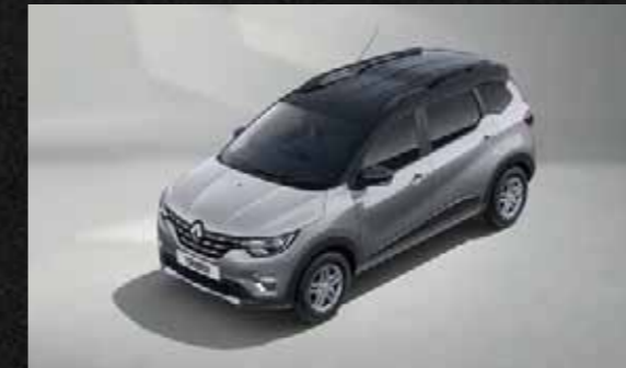
MOONLIGHT SILVER (MP)