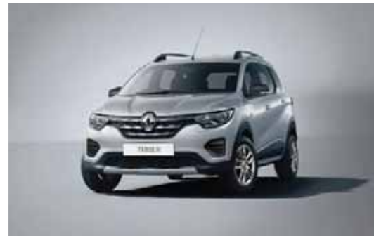
MOONLIGHT SILVER (MP)