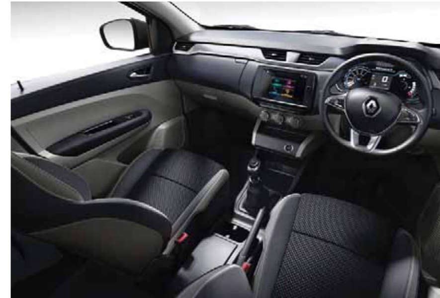
Zen interior with Japda fabric upholstery