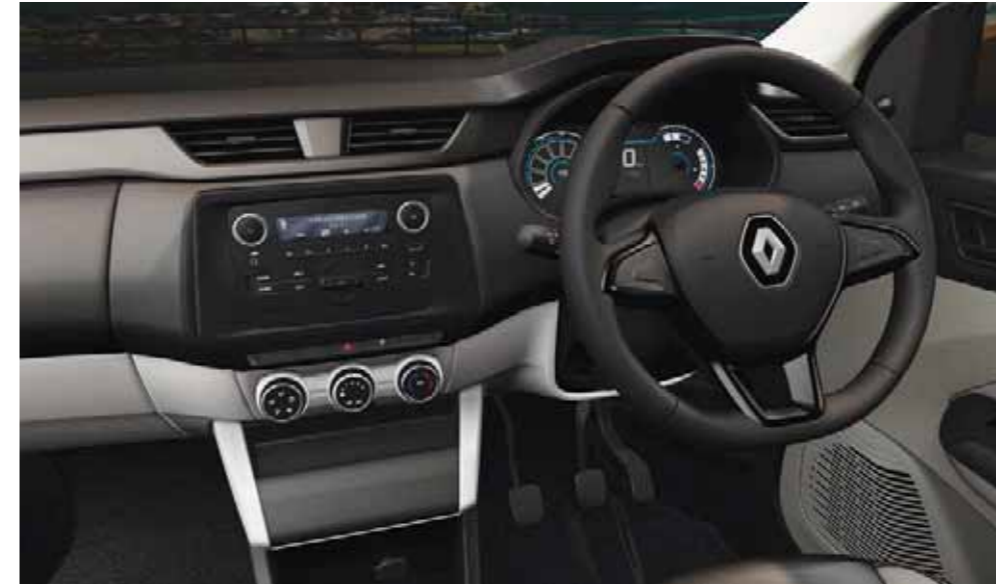
Life interior with R&Go ® radio