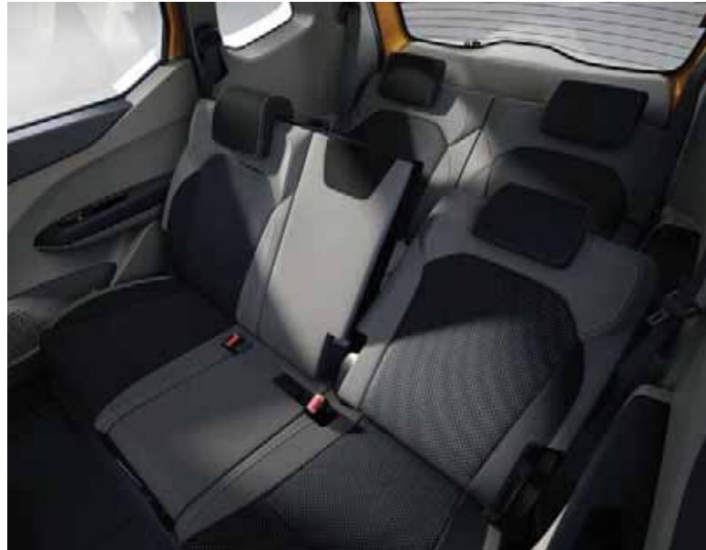
Dual tone 3D Space fabric upholstery