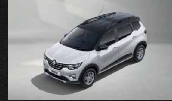
ICE COOL WHITE (NM)