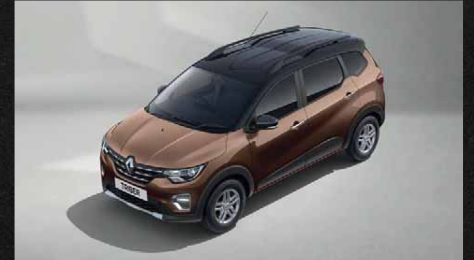
CEDAR BROWN (MP)