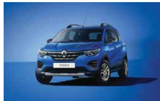
ELECTRIC BLUE (MP)