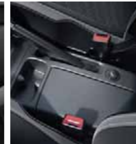
Centre console storage