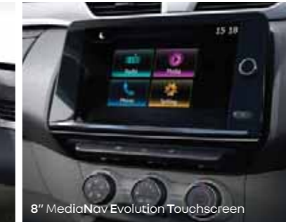
8" MediaNav Evolution Touchscreen