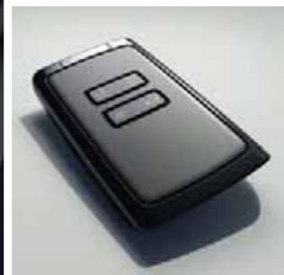
Keyless entry with push-button start/stop