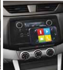
R&Go® radio with additional accessory smartphone mount