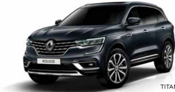
TITANIUM GREY (MP)