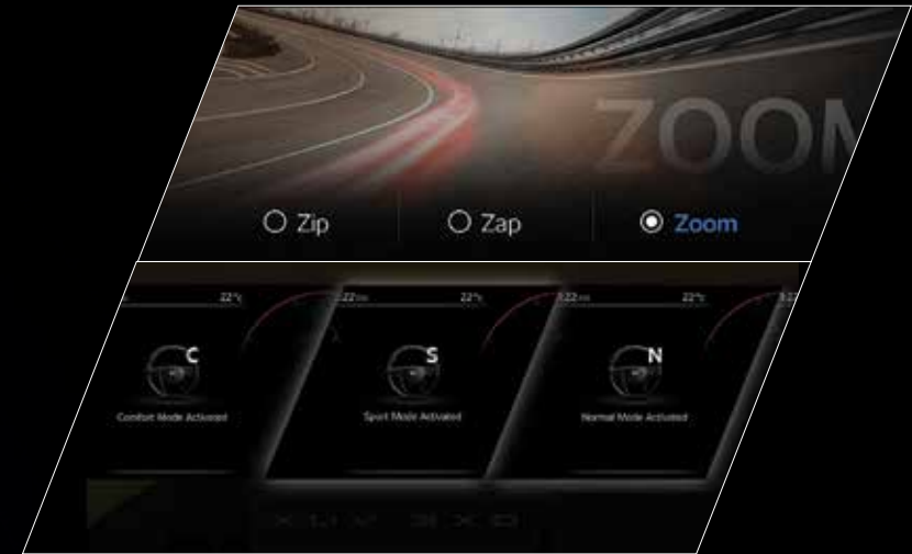
Smart Steering Modes (Standard from base)