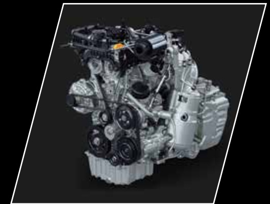
1.2L turbo petrol engine with 82kW power and best in class 200 Nm torque for quick acceleration and fast overtaking