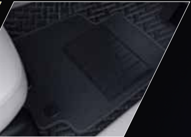
3D floor Mats