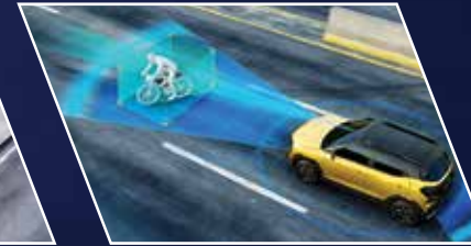
Auto Emergency Braking (Cyclist)