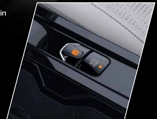
Electronic Power Brake & Autohold