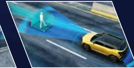
Auto Emergency Braking (Pedestrian)