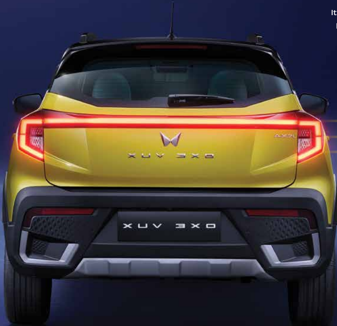
Captivating LED Tail Lamps & Rear Infinity Light Bar

The XUV 3XO's interior complements its striking exterior with a blend of premium finishes and modern design elements and equipment.