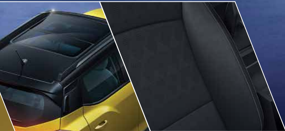
Panoramic Skyroof™ – largest in its class

Its cabin boasts premium interiors with a soft-touch leatherette dashboard that extends to the door trims and leatherette seat upholstery to elevate the sense of sophistication. Leather accents on the steering wheel, gear knob and front armrest further enhance the premium feel.