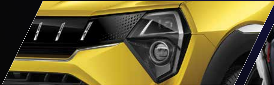
LED fog lamp