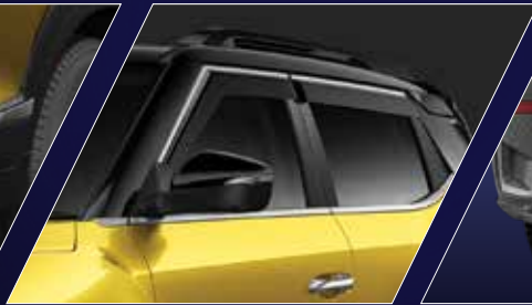
Chrome rain visor