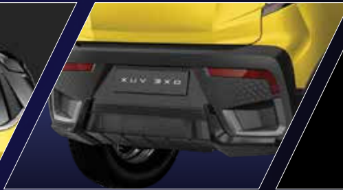
Rear bumper add on