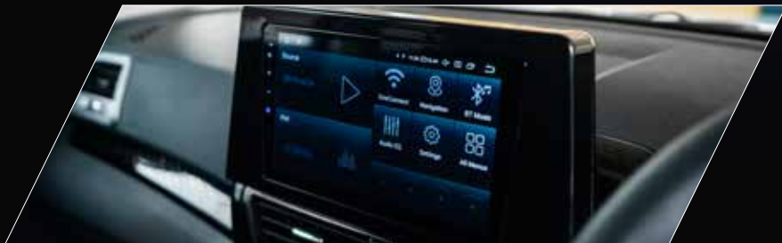
9"Display Audio (MX2)