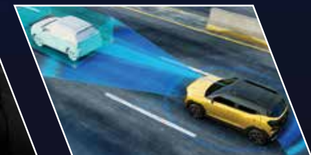
Auto Emergency Braking (Vehicles)

Furthermore, the vehicle comes standard with six airbags, four disc brakes, 3-point seat belts and seat-belt reminder for all seats along with passenger airbag on/off for child safety, ISOFIX child seats with top-tether, among others, providing comprehensive protection for all occupants.