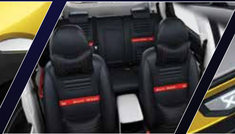
Seat cover - Black with Red Insert