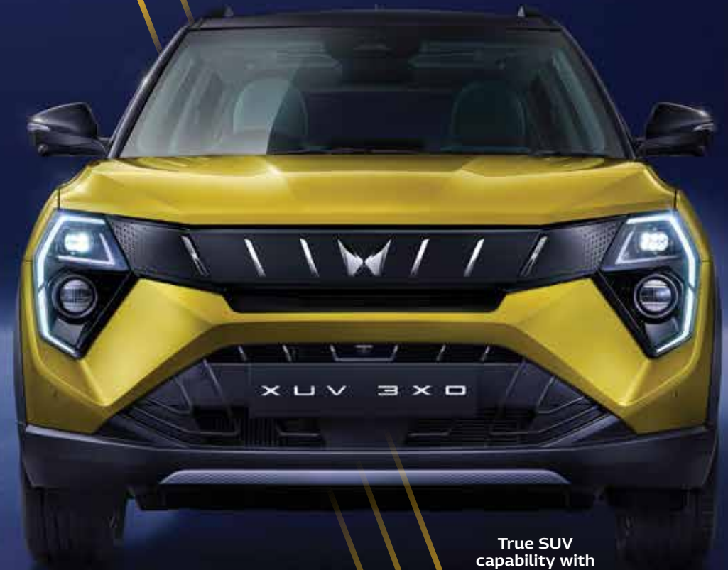
True SUV capability with imposing stance

*Specifications may vary by model. Disclaimer: Creative visualisation. For illustrative purpose only.