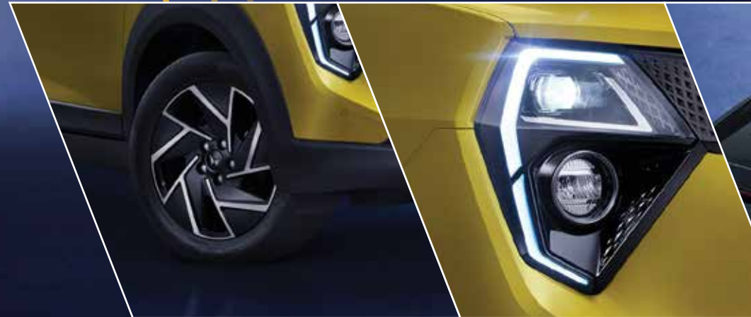
R17 Diamond Cut Alloy Wheels