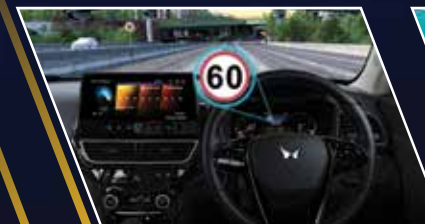
Traffic Sign Recognition