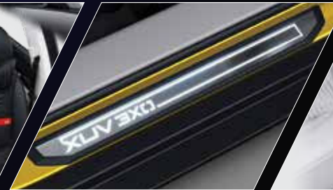
Illuminated scuff plate