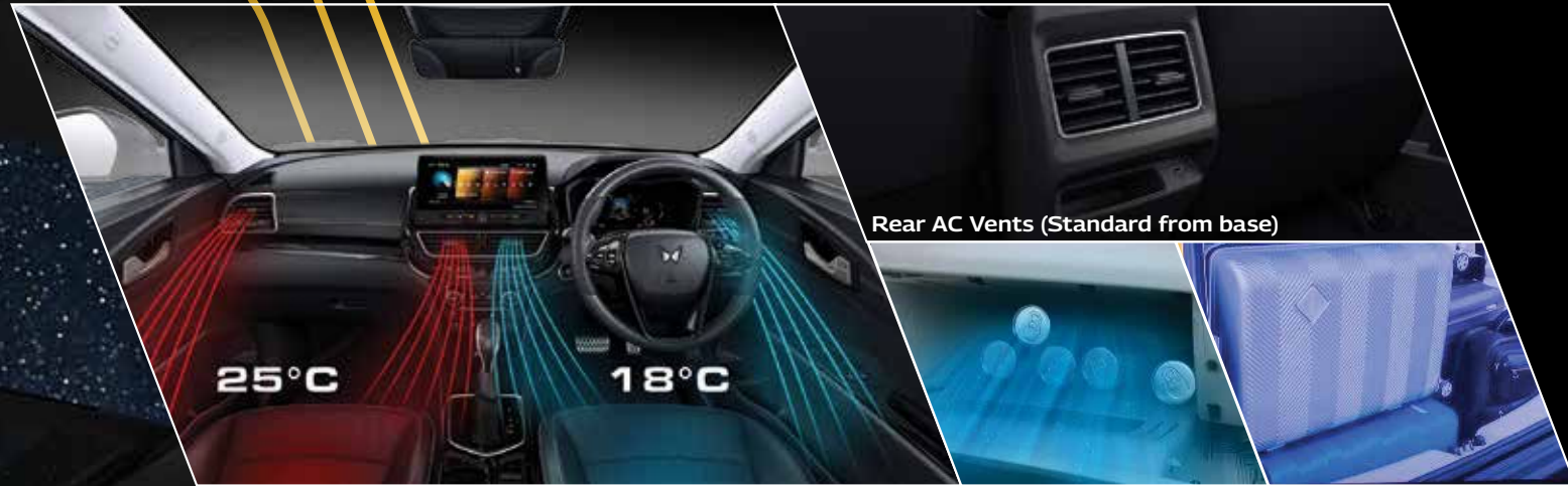
Dual Zone Climate Control