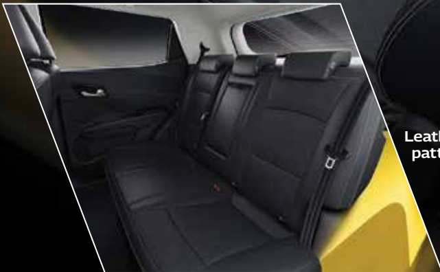
Leatherette seats with diamond-mesh patterns & decorative stitching

**Boot space as per ISO V215. Disclaimer: Creative visualisation. For illustrative purpose only.